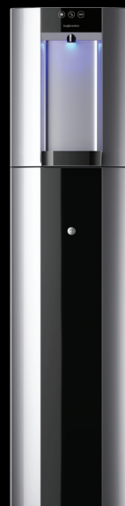
Silver - Floorstanding