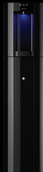
Black - Floorstanding