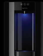
Black - Countertop