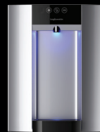
Silver - Countertop

Contains 3M carbon filter and parts required for easy installation.