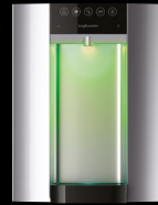
Silver - Countertop

Bluetooth Alarmed Drainless Waste Kit Leak protection through high water level audible alarm and system deactivation.