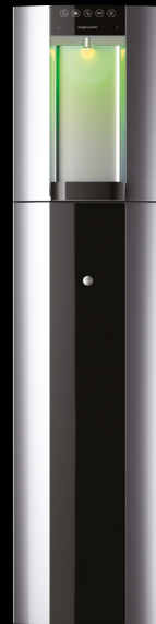
Silver - Floorstanding