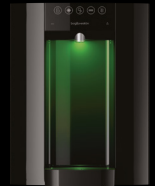
Black - Countertop